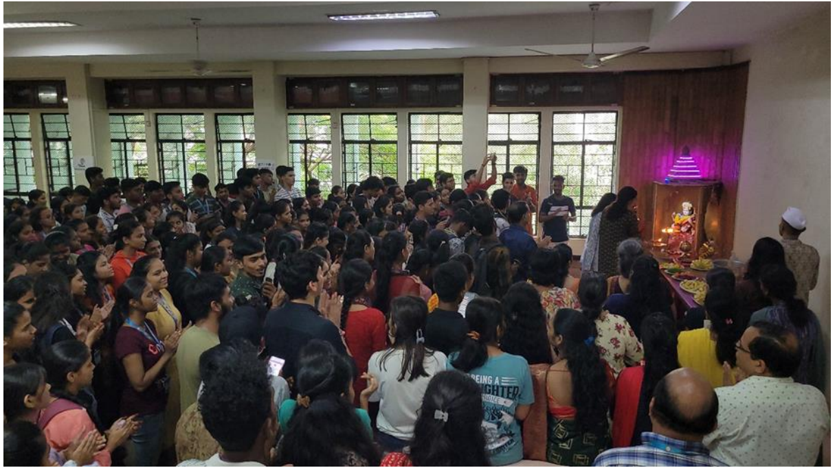
Students in large numbers gathered for Ganpati Bappa Maha Aarti.