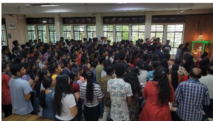
Students gathered for Shree Saraswati Pooja, Aarti, and Garba after that.

Along with the Navratri colour celebration, the Saraswati Pooja, Aarti, and Garba celebrations were conducted on 23 rd October 2023. Once again, the staff and students spread joy and energy as they participated in Aarti and Garba, held on the school side stilt area.