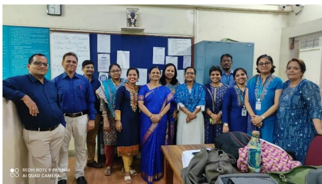
Staff members all adorning one colour at 'Celebrate Navratri with colours'

Along with the Navratri colour celebration, the Saraswati Pooja, Aarti, and Garba celebrations were conducted on 23 rd October 2023. Once again, the staff and students spread joy and energy as they participated in Aarti and Garba, held on the school side stilt area.