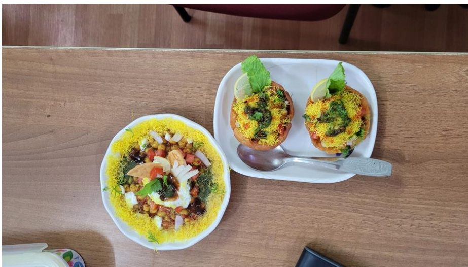
Chat making competition, Chat items beautifully plated.