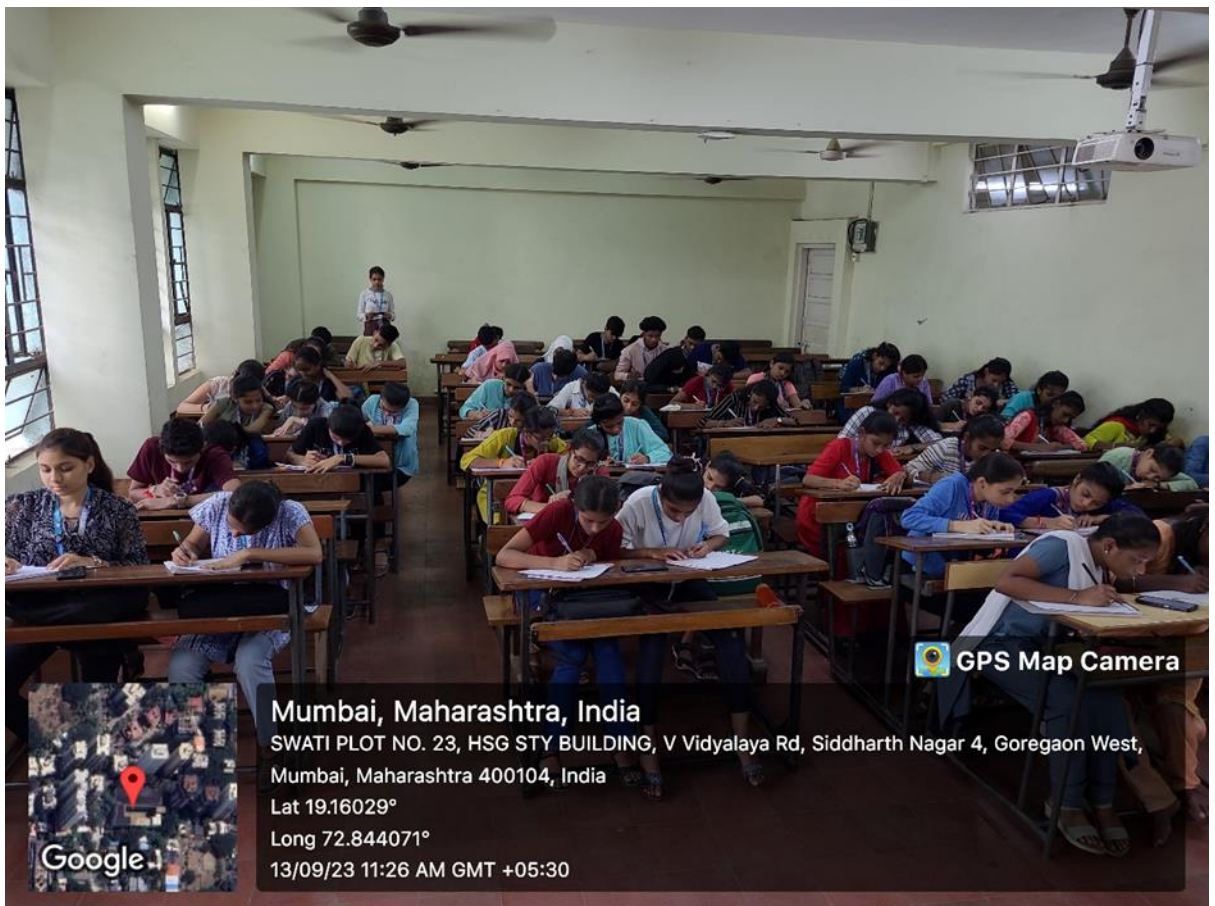
A classroom full of students attending a handwriting competition