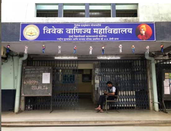
Diwali celebration at Vivek College with Rangoli and Kandil welcoming all