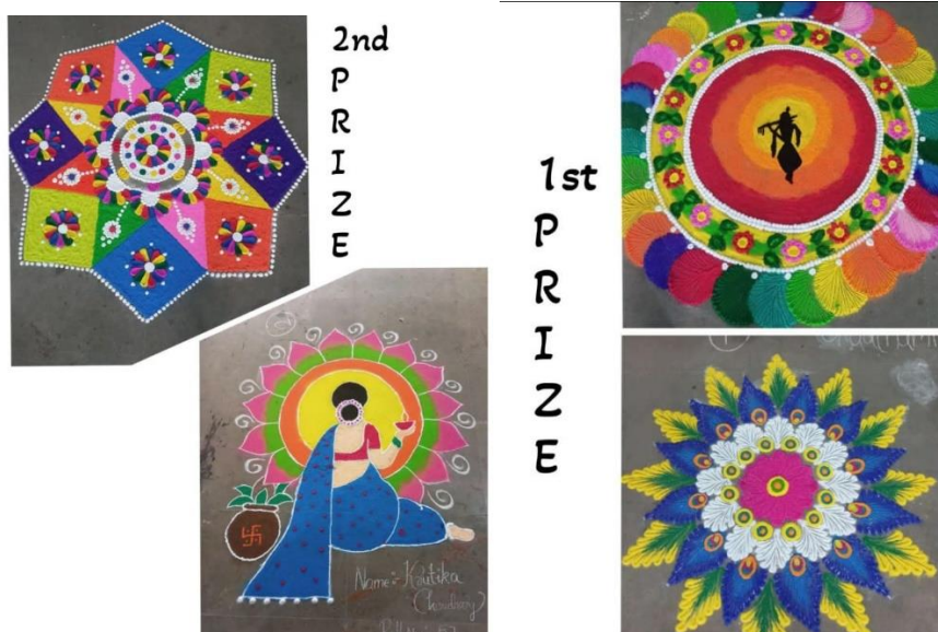
Prize-winning rangolis at rangoli competition