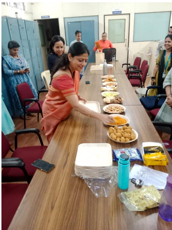
Diwali celebration at Vivek College with Diwali Pahat and Diwali Pharal