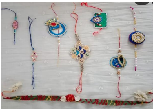
Students made rakhi for the Rakhi-making competition.