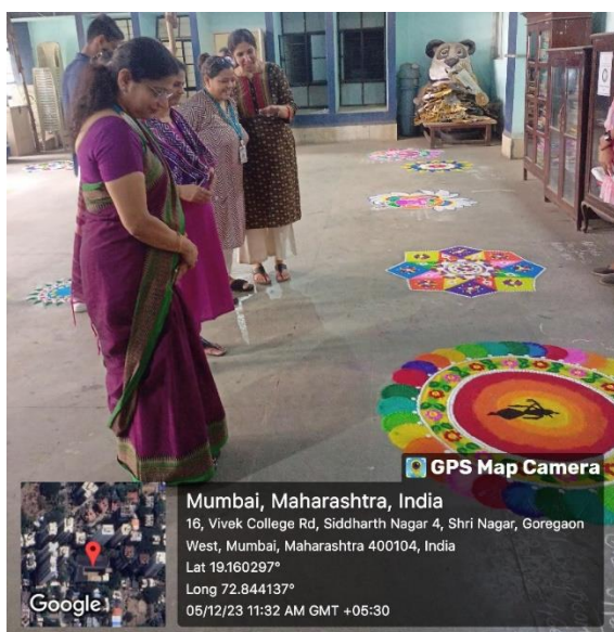
Principal and staff members observing Rangoli displayed at the Rangoli competition.