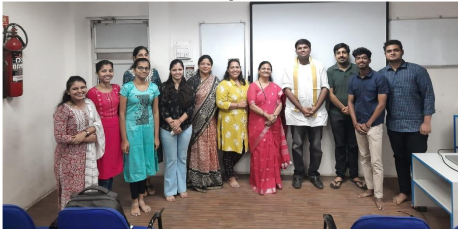
Participants of Kathamrit at the closing ceremony of Kathamrit